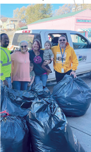
BPU employee volunteers gathering and delivering Thanksgiving meals and bags of donated winter coats and toys for area children this holiday season.